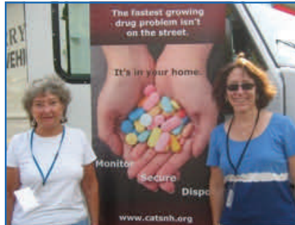
The Community Alliance for Teen Safety in Derry, NH used their 2011 Healthy Living Grant to develop an e-learning module for young people on the misuse of prescription drugs.

In previous years, prescription safety Healthy Living Grants have funded youth-led social media campaigns, parental toolkits and workshops, and age-appropriate e-learning modules.